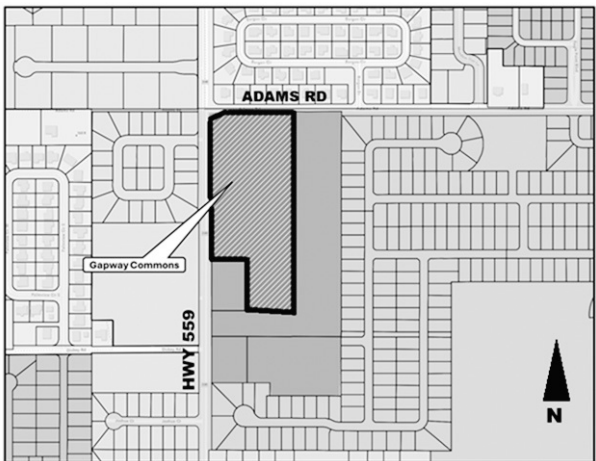
(ORDINANCE NO. 1825 MAP)

AN ORDINANCE OF THE CITY OF AUBURNDALE, FLORIDA, AMENDING ORDINANCE NO. 764, THE LAND DEVELOPMENT REGULATIONS OF THE CITY OF AUBURNDALE, FLORIDA, BY AN AMENDMENT TO THE ZONING MAP BY RECLASSIFYING +/- 11.41 ACRES FROM PLANNED DEVELOPMENT -COMMERCIAL 1 (PD-C1) TO AN AUBURNDALE ZONING MAP CLASSIFICATION OF VILLAGE CENTER (VC); AND PROVIDING AN EFFECTIVE DATE (General Locations: CR-559 and Adams Road)